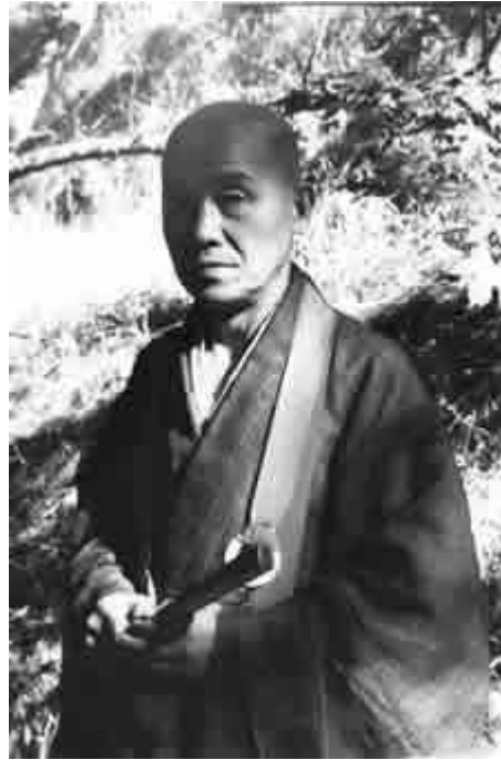
Nakagawa Sōen Rōshi